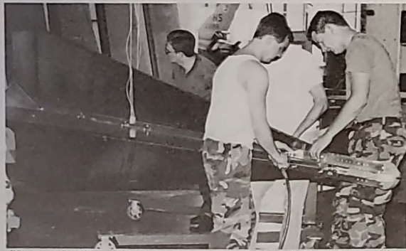
"It was a lot like putting together a model airplane." Here the munitions team balances a dart prior to it's "flight".

These darts, however, which weigh in between 70 to 80 pounds and 16 feet long, were not exactly the type you'd want to toss at a gameboard. But they did prove to be ideal targets for 507th F-16 pilots when towed behind an F-86 support aircraft.